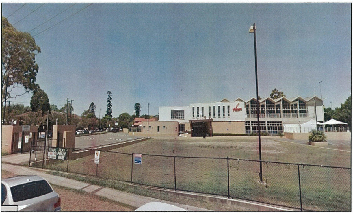
Photograph 1 shows the site as viewed from George Street.