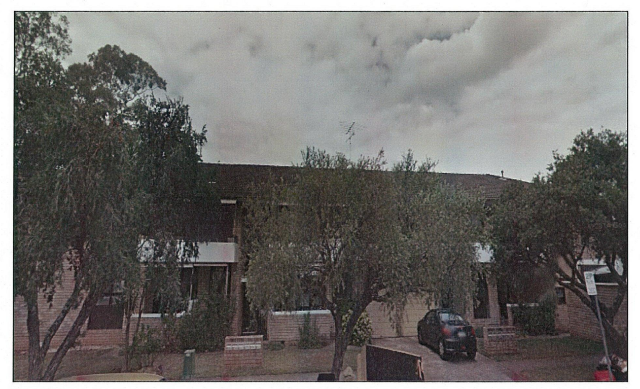
Photograph 6 shows existing residential land uses along the eastern side of Purchase Street, as viewed from the subject site.