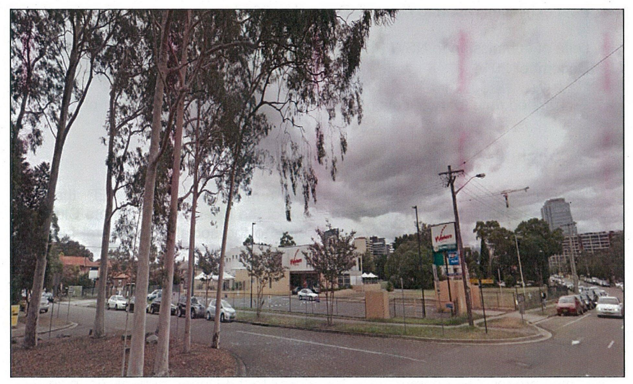
Photograph 2 shows the subject site from the intersection of George Street and Purchase Street.