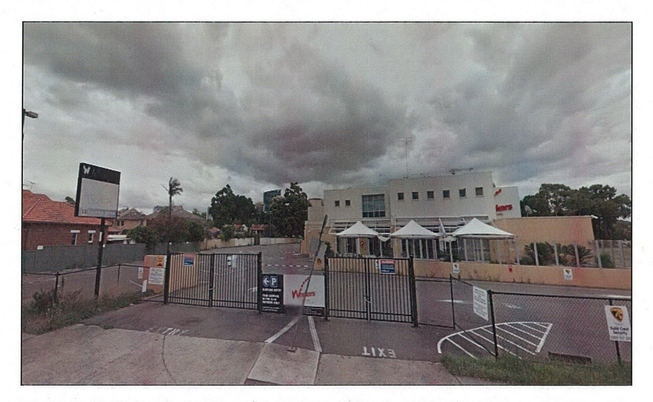
Photograph 4 shows the site as viewed from Purchase Street